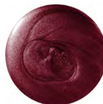
289 You Set My Heart Ablaze