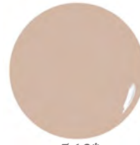
563* Good For Muffin