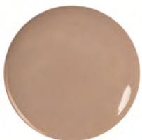
60135 Booty Call