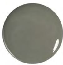
497 The Gray Debate