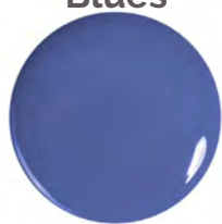
488 La Boca Blue