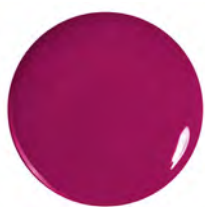
357 South Beach Pink