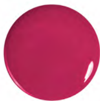
393 Pink Thong Hong Kong