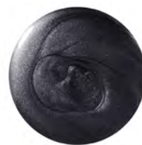
530 Pewter Perfect