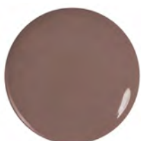
60032 Call Me Classy