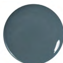
60048 Sing the Blues