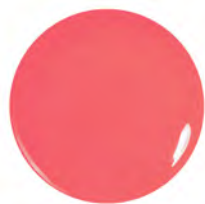
372 Bahama Mama