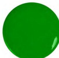
95214*V Lil Toad