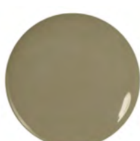
549 How Insultan