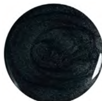
60027 Midnight Fright