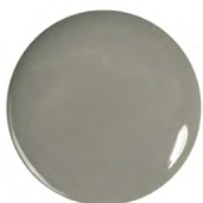
411 Lovey Dovey