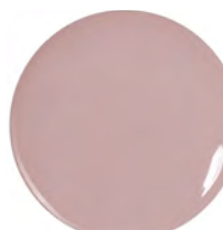
600 Peaceful Mind