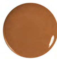
499 Burnt Caramel