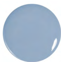
443 Dandelion Tears