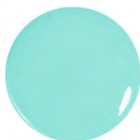
60072 Bondi Beach Babe