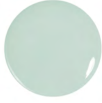
466 Mint To Be