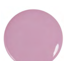
553 Maraketch Me If You Can

Polish colors and brilliance may vary slightly from actual polish due to photography lighting, settings, and editing of images.