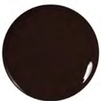
423 Barking Up The Wrong Tree