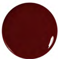
2 Deep Red