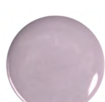
440 Pretty Plieés

Polish colors and brilliance may vary slightly from actual polish due to photography lighting, settings, and editing of images.