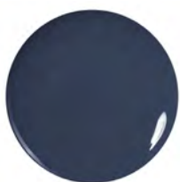
525 Hulla Blue