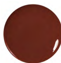
360 Sunset In Sedona