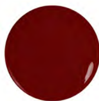
520 Plant Your Sugar Lips Here