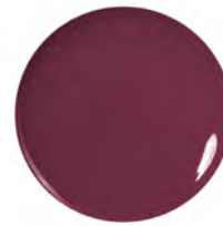
339 Smokey Rose