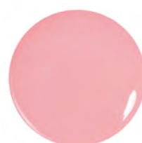
539* Sheer Heaven