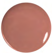
492 Wood You Get Wild With Me