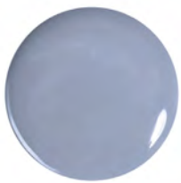
526 Faerie Pale Purple