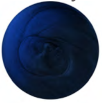
480 I Got the Pick Me Up Blues