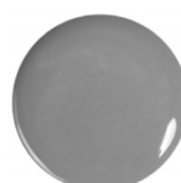
354N Concrete Jungle

Polish colors and brilliance may vary slightly from actual polish due to photography lighting, settings, and editing of images.