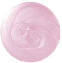
317 Iced Pink Parfait