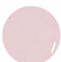
493* A Cape May Perfect Get Away

Polish colors and brilliance may vary slightly from actual polish due to photography lighting, settings, and editing of images.