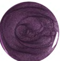
346 Amethyst & Diamonds