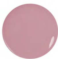
558 Fred & Ginger