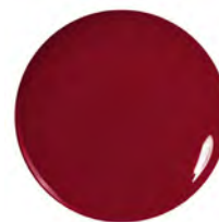
59 Hot Red