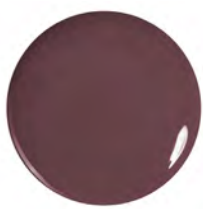
495 Hazy Lilac