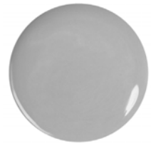
533 Silver Lining