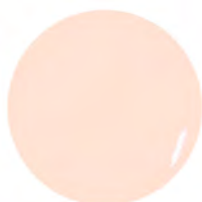
60081* Palest Pink