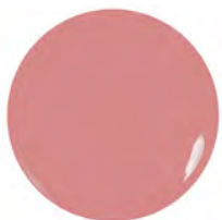
60039 Pretty Pink Bikini