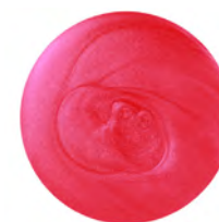
324 Fiery Coral