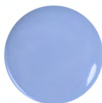
537 Fleurs Blues