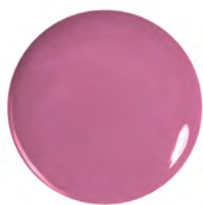
285 Hot Kinky Pink