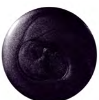
353 Starry Nights