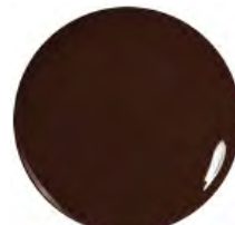
60142 Send Nudes