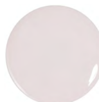
601 Be Kind