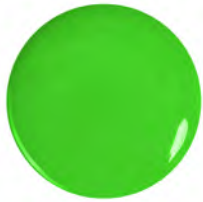
60127*V Pucker Up