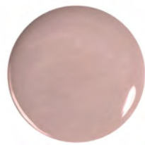
485* Havana Rose