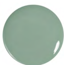
445 Diabolically Demure