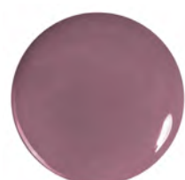
420 Hickory Trickery