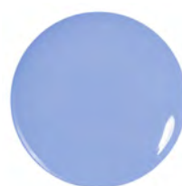
407 Corn Silk-y Smooth