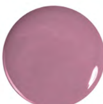
240 Free and Easy