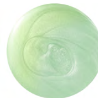
543 Top Off