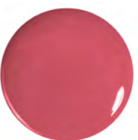
303 Pink Paradise