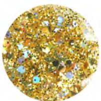
60144 Magical Gold