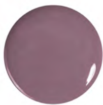
442 On Pointe