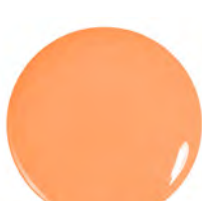
60121* V Tahitian Sunset