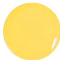
60069 Koala For A Dolla