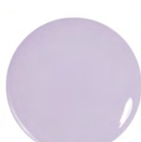
431 Forever 17