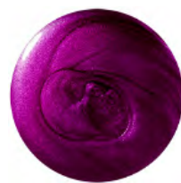
478 Express Your Jelly Self