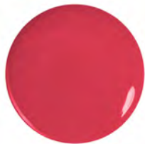
60061 Valley Girl