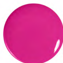
60106* V Purple Thunder