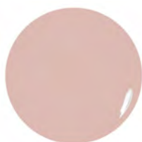
418* French Kiss