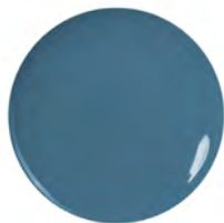
60129 Turquoise Waters