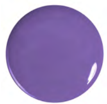
595 Can't Be Tamed