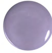
468 Purple Majesty