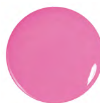
592 Flocking Fabulous