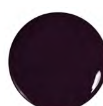
60010 Eggplant Creme