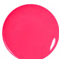
60123* V I Pink You're Crazy

Polish colors and brilliance may vary slightly from actual polish due to photography lighting, settings, and editing of images.