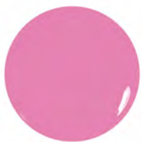
371 Sex On The Beach