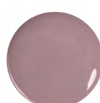
60009 Taupe Shimmer