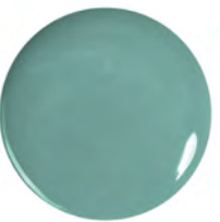
328 Oh, Tiff!