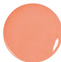
419 Peaches & Cream