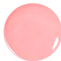
484 Loose Lips Pink Ships