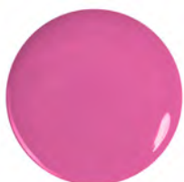
60115* V Hippy Dippy