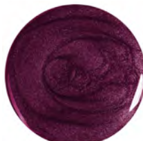
232 Sparkling Sherry