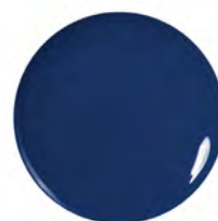
384 Mountain View Blue