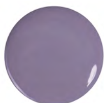
60074 Mates Before Dates