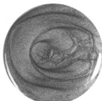
293 Silver Brocade