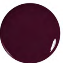
341 Mulberry Mayhem