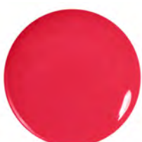
60116* V California Dreamin'