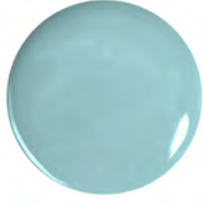
467 My Baby Blue