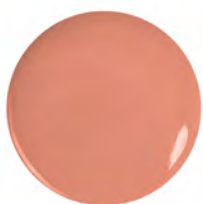
535 Spring Has Sprung