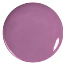
536 Bloom & Grow