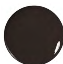
454 Semi Sweet