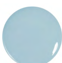
430 Robin The Cradle