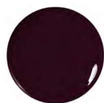
361 It's Nothing To Wine About