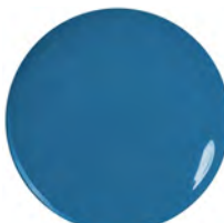
99984 Bold Blue

Polish colors and brilliance may vary slightly from actual polish due to photography lighting, settings, and editing of images.