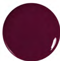
156 Park Ave. Purple