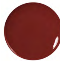
292 Nice & Spicy