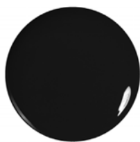
286 I'm Raven About You