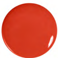
482 Million $ Vermillion