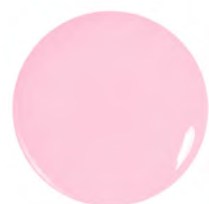
389 Cherry Blossom