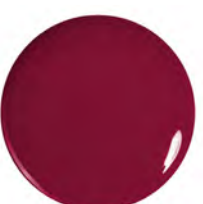
314 Cranberry Crush