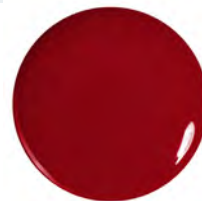
60132 Red Velvet