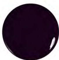
298 Darkest Desire