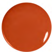
284 Orange You Sexy