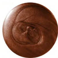
313 Royal Fool's Gold