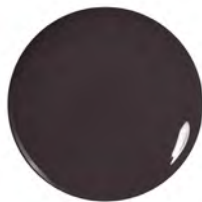
60114 Raisin' A Ruckus