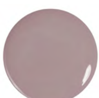
60119 Putty In My Hands