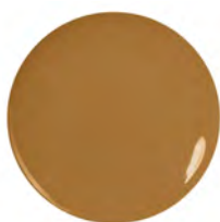
548 Meet Me In Tangier Dear