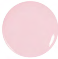
518* Pixie Pink