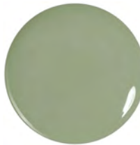
597 Lend A Hand