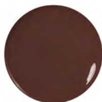
60064 Cinnamon Broom