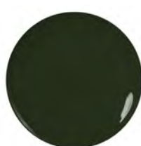
559 Million Dollar Trooper