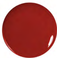
276 Red Hot Nights