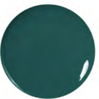
326 Don't Teal My Heart Away