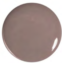
486 Tanning In Tahiti