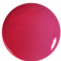
121 Fuchsia Flash