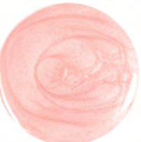
329 Sweet As Sugar