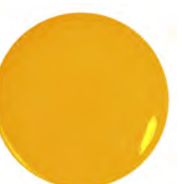
319 Lemon Yellow Zest