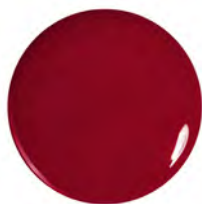
4 Texas Red