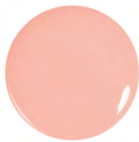
527* Piggy Toe Pink