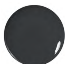
410 Smoke Signal