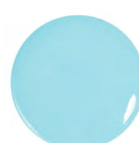
594 Tropic Like It's Hot