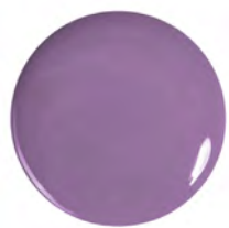
356 Pelican Peak Purple