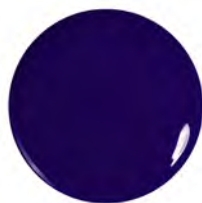
416 Co-Balt Deep