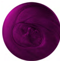
460 Royally Raunchy