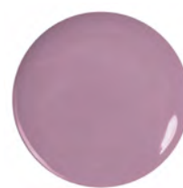
580 Embrace Me