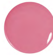
565 I Only Have Pies For You