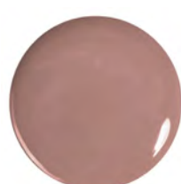
471* Fine & Sandy