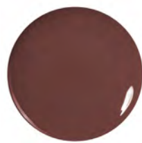
469 Brick It To Me Gently