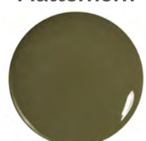
524 It's About Thyme