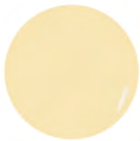
515 Sidewalk Chalk