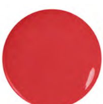
547 Rum Runner