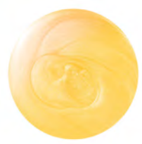
405 Sunshine and Daisies