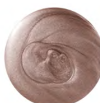
60002 Copper Foil