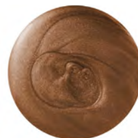
60037 Bronzed Beauty