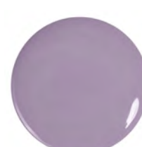
60011 Pastel Purple

Polish colors and brilliance may vary slightly from actual polish due to photography lighting, settings, and editing of images.