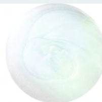
60131 South Sea Pearl