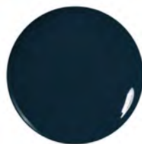
383 Park City Blues