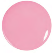
464 Make Me Blush