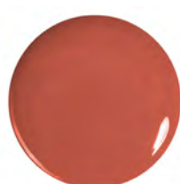
470 A Lotta Terra Cotta