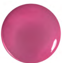
308 Pink Ribbons For M'Lady