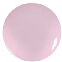
441 Barre None