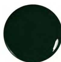
596 There Is Hope