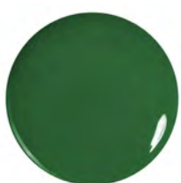
491 Lucky In Atlantic City