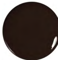
598 United We Stand