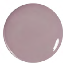
456 Bare & Beautiful