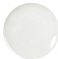
157 French Vanilla