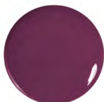
496 Violet Uproar