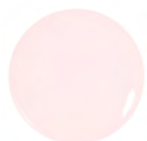
540* Pure Innocence