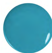
521 Candy Button Blue