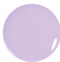
591 Free As A Bird