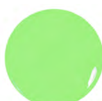
60122* V Hot Lime In The City