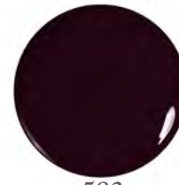
583 Love Language