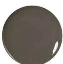
473 It's a Coy Girl Thing