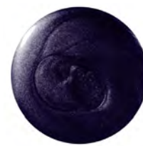
311 Mystical Knights