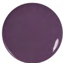
60028 Lavender Luxury