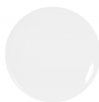
561 Flour Power