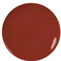
534 Fired Up