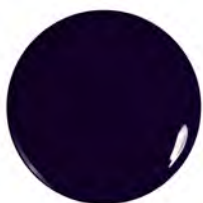
340 Crushed Velvet