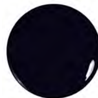
60030 She's A Vamp