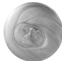
504 Does It Really Matterhorn