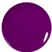
60125*V Ultra Violet