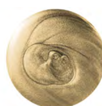
60003 Gold Foil