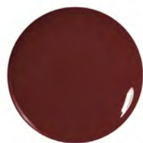
475 Sitting On Cloud Wine