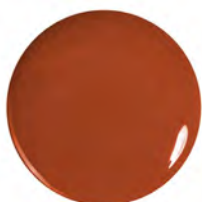
60018 Burnt Orange