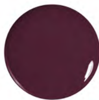
382 Fireside Flirtation