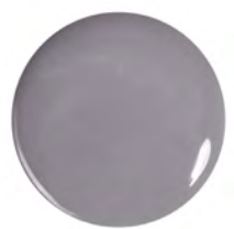
572 Sweater Weather