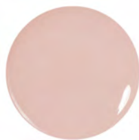
278* Tickled Pink