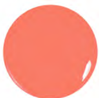
60080 Melon Mania