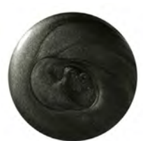
426 Olive Juice