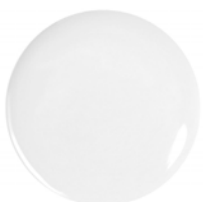
1702 Fluffy White Puppy