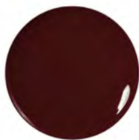
275 Wicked and Wild