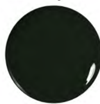
575 Sparks Fly