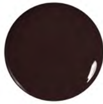
528 Paint The Brown Red