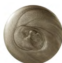
448 Money Maker