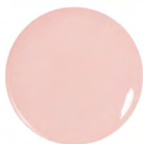
130N* French Pink Too