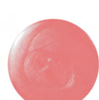
434 Who Are You Calling Baby?