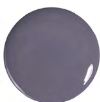
472 The Dusky One