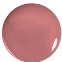
228 Velvet Rose