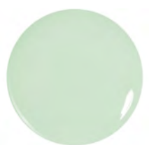
587 Tipsy on the Terrace