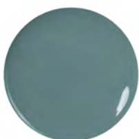
60040 Beach Resort Blue