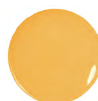
593 Tou-Can Play