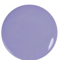
589 Stomping Grapes