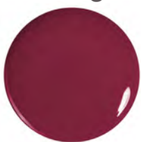
483 Burano Berry